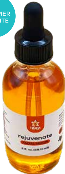
REJUVENATE - FACIAL SERUM (UNSCENTED) 2 OZ $15.00 ($30.00 MSRP)