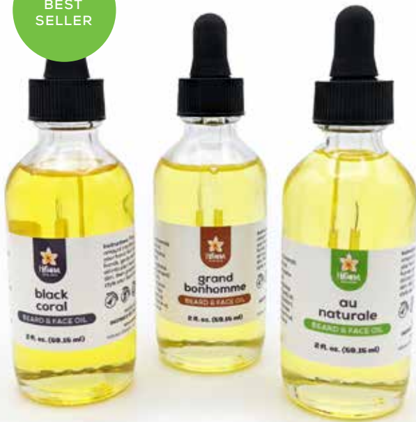
BLACK CORAL - BEARD OIL 2 OZ $15.00 ($30.00 MSRP)