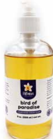
BIRD OF PARADISE