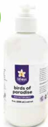
BIRD OF PARADISE