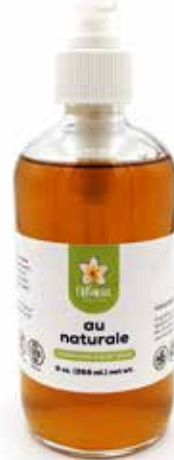
AU NATURELLE (UNSCENTED)