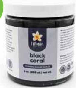
BLACK CORAL + activated charcoal