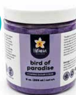
BIRD OF PARADISE