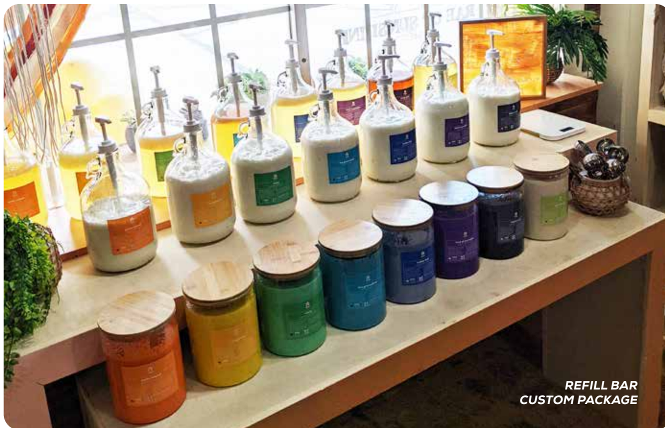
REFILL BAR CUSTOM PACKAGE