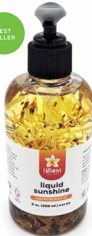
LIQUID SUNSHINE - BODY OIL (UNSCENTED) 8 OZ $12.50 ($25.00 MSRP)